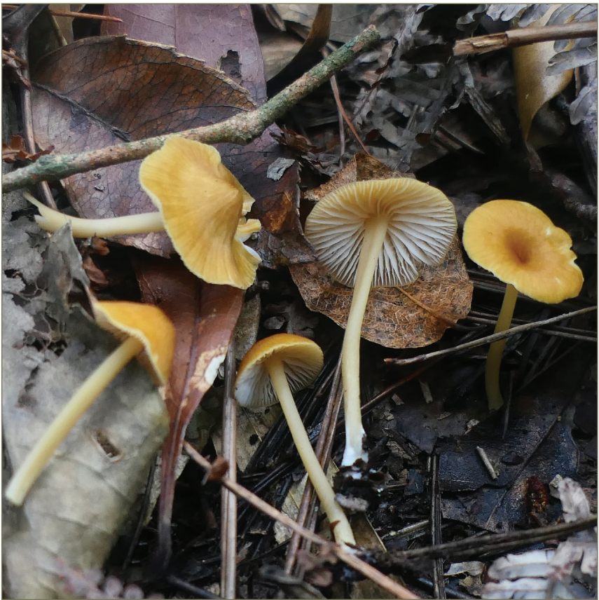
Entoloma subpraegracile J.Q. Yan, L.G. Chen & S.N. Wang, sp. nov.