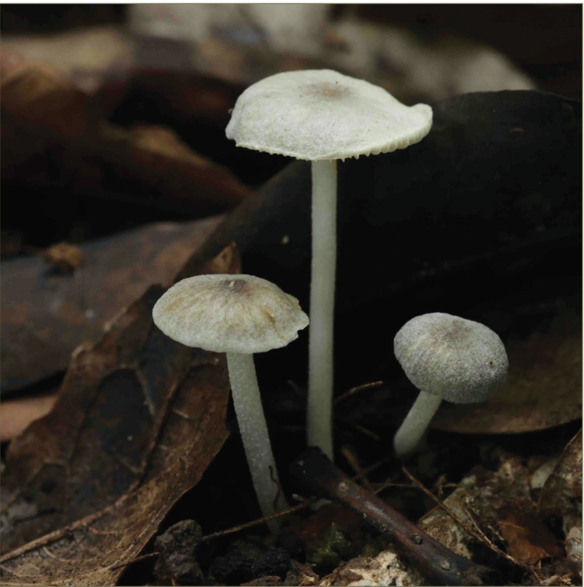
Gerronema pubescence Ming Zhang & W.X. Zhang, sp. nov.