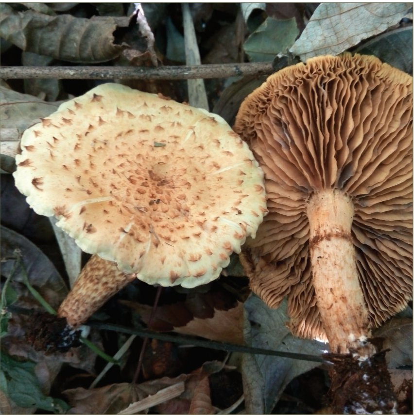
Pholiota cylindrospora E.J. Tian, sp. nov.