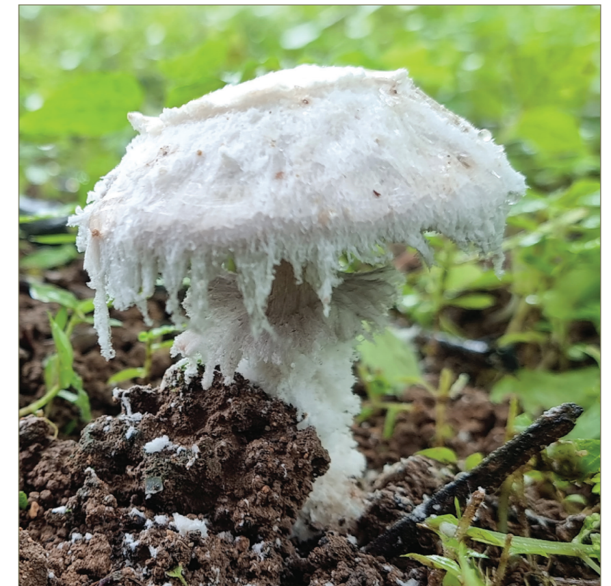
Hymenagaricus wadijarzeezicus Al-Sadi et al., sp. nov.