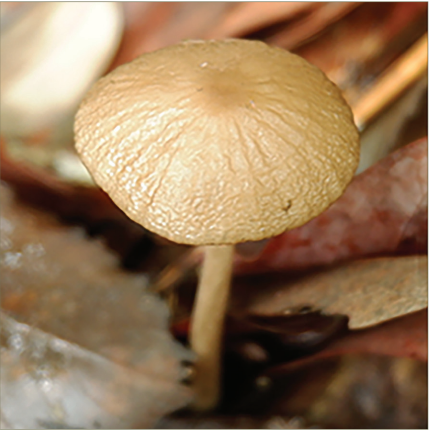
Hymenopellis straminea Niego & Raspé, sp. nov.